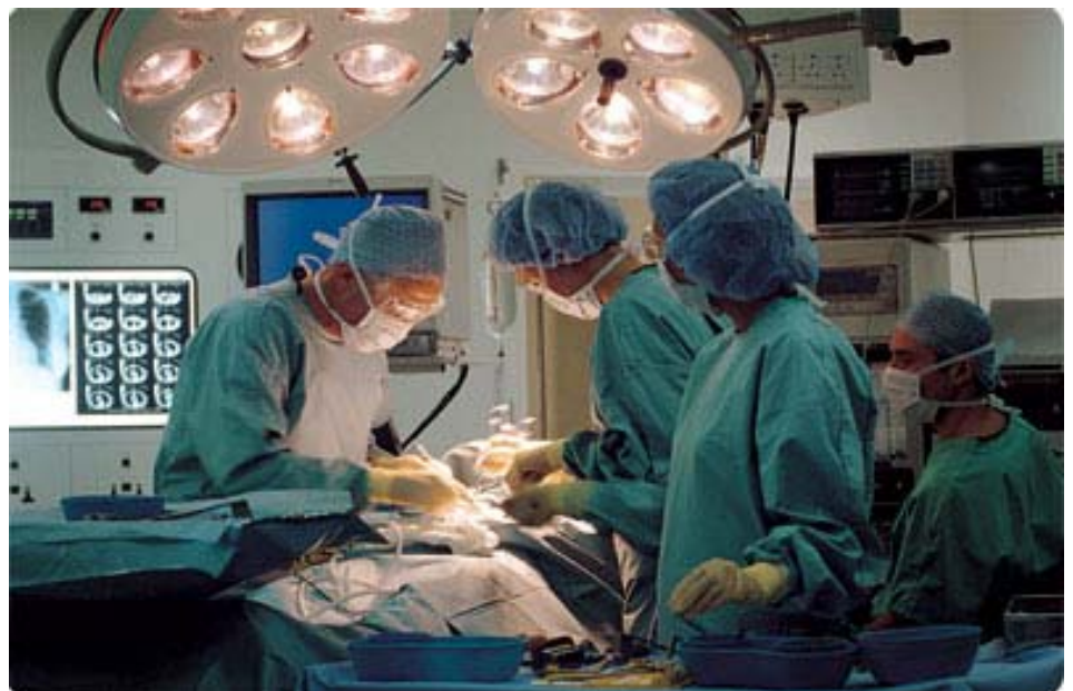
Medtronic's surgical navigation education and training classes help to ensure success with their technologies.

Over the years, they adapted additional technologies for the human body, including radio frequency therapies, mechanical devices, drug and biologic delivery devices, and diagnostic tools. Today, their technologies are used to treat more than 30 chronic diseases affecting many areas of the body.