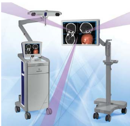
StealthStation® surgical navigation systems

The curriculum offers continuing education on surgical imaging and surgical navigation technologies for clinicians, including surgeons, nurses (includes contact hours), and biomedical engineering. The curriculum is designed to provide practical knowledge of the software applications, instrumentation and imaging protocols used with their StealthStation® surgical navigation systems , O-arm® and PoleStar® intra-operative imaging solutions.