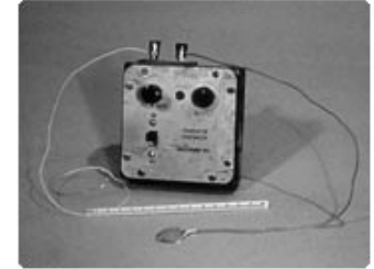
The inspiration for Medtronic's first pacemaker was a musical metronome.