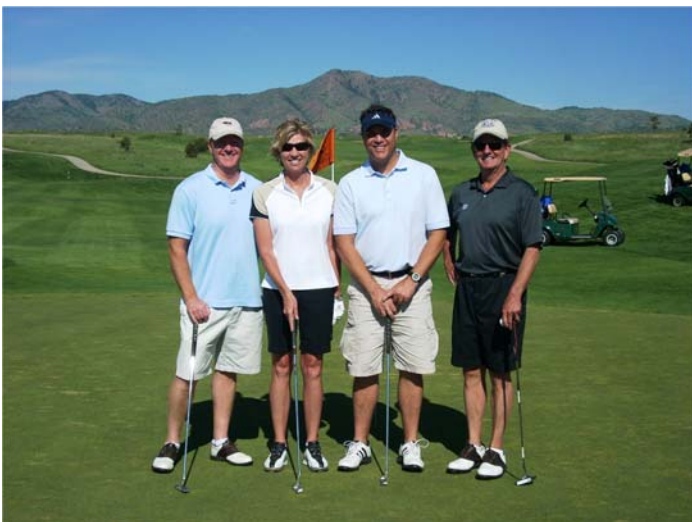
Johnson & Johnson Team