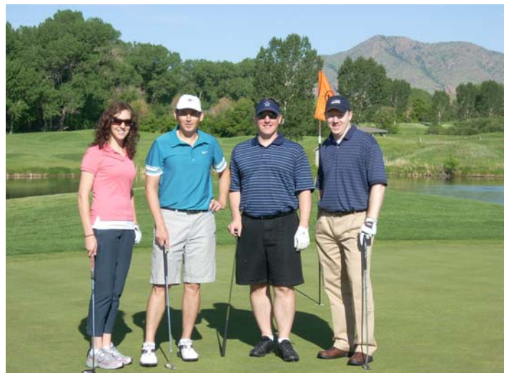
Ernst & Young Team